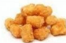
TATER TOT CASSEROLE