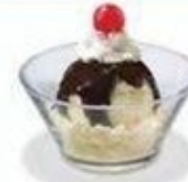
HOT FUDGE SUNDAE