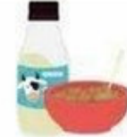
MILK AND CEREAL