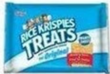
RICE KRISPIE TREAT