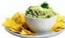
CHIPS AND GUACAMOLE